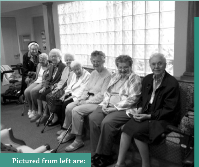
Pictured from left are: